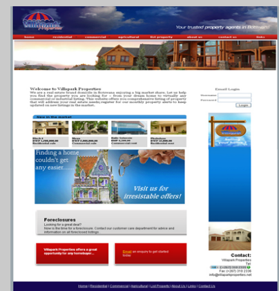
Client: Villapark Properties