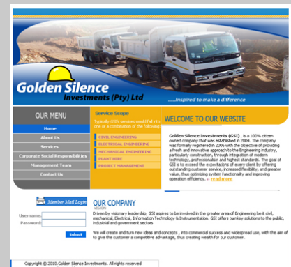
Client: Golden Silence Investments