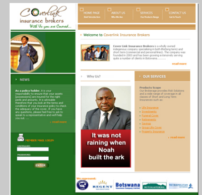
Client: Coverlink Insurance Brokers