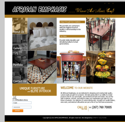
Client: African Emphasis